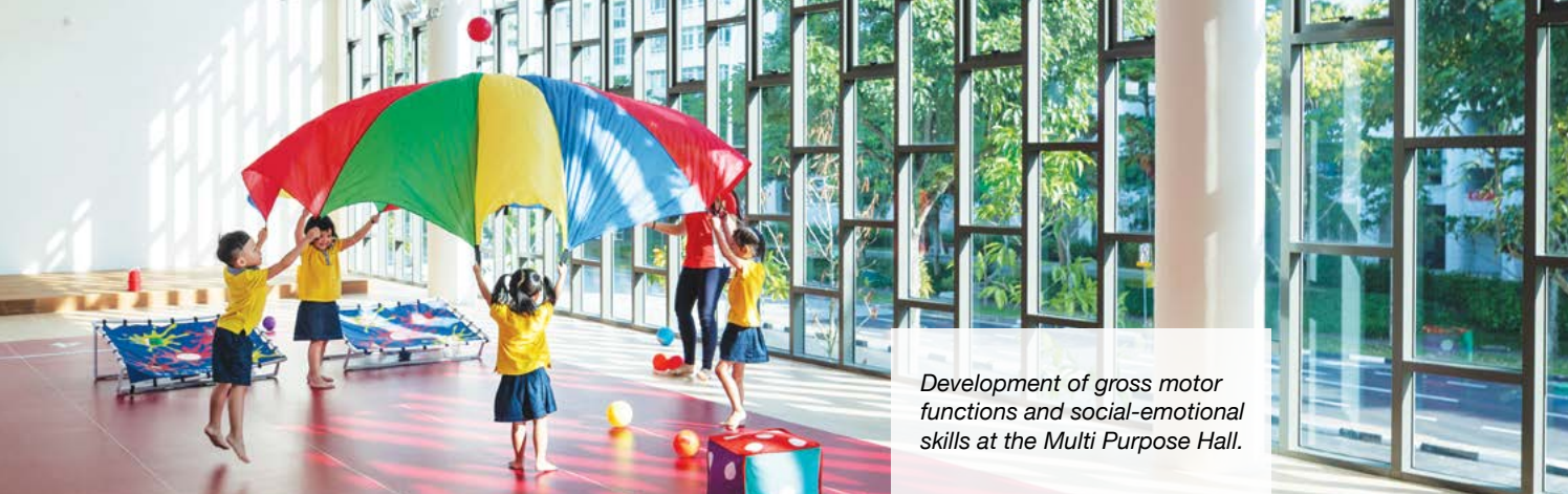
Development of gross motor functions and social-emotional skills at the Multi Purpose Hall.