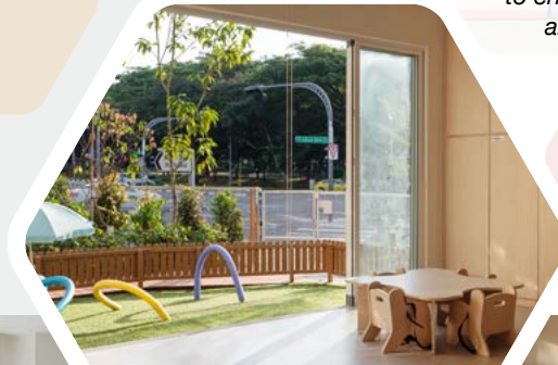
Spacious mobile area for gross-motor development and play time.