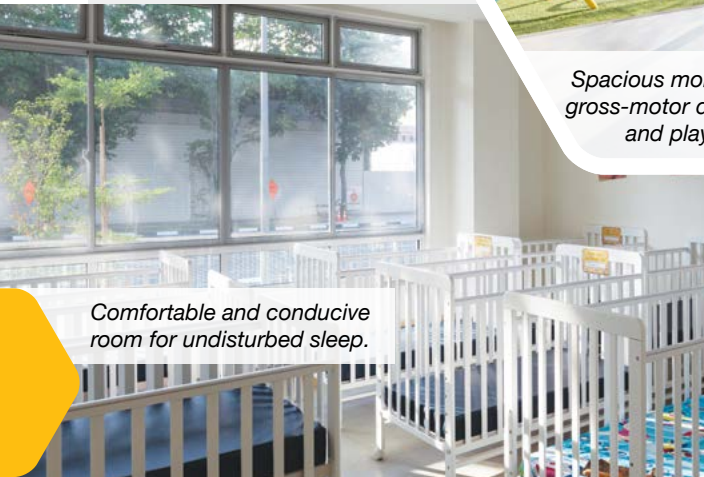
Comfortable and conducive room for undisturbed sleep.