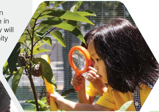
Children will be exposed to a wide range of sensorial experiences at the garden.

Your child will have a chance to be an urban farmer and plant a variety of edible produce in the campus' Community Herb Garden. They will even learn and work alongside the community and senior residents in the neighbourhood, promoting inter-generational engagement.