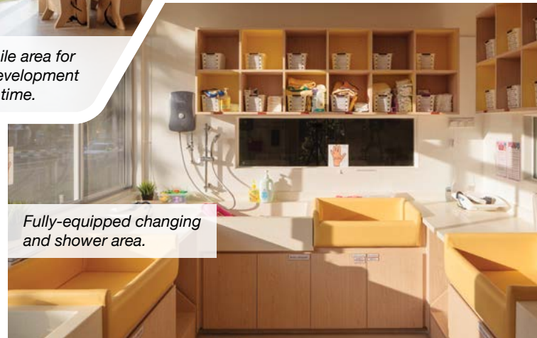
Fully-equipped changing and shower area.