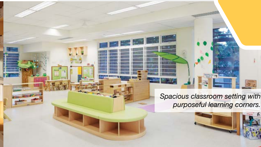
Spacious classroom setting with purposeful learning corners.