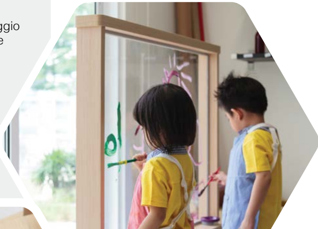
Creativity will flourish as children play and explore different mediums of expression at the Atelier.

Here, they are encouraged to push their creativity boundaries by using various recycled and natural art materials, as well as express their thoughts through artistic mediums.