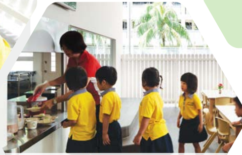
The Open Kitchen allows children to observe and experience the process from harvesting, cooking to serving of meals.