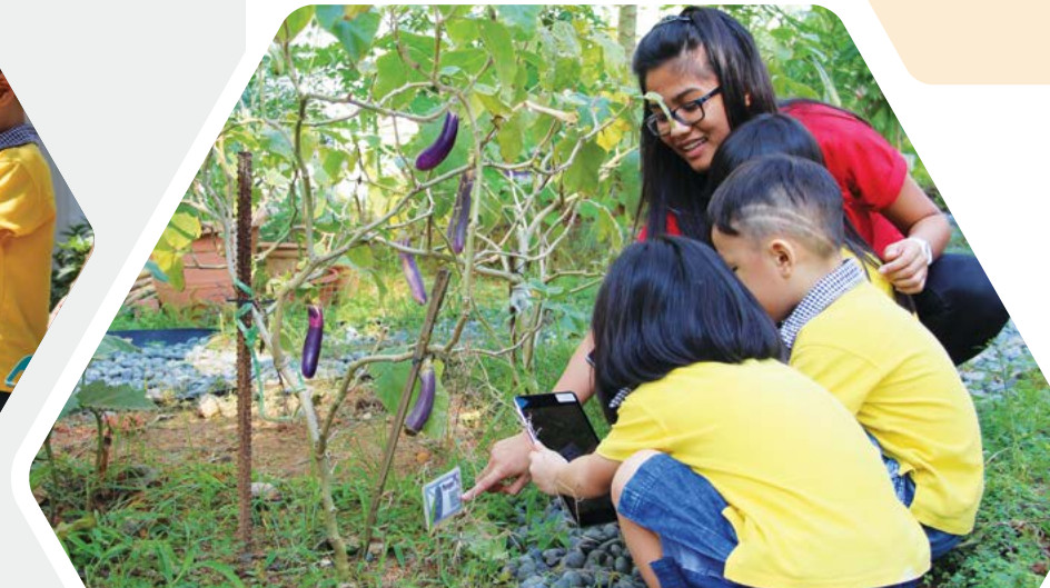
Smart Community Herb Garden allowing children to interactively "swipe through the lesson" on their tablets.