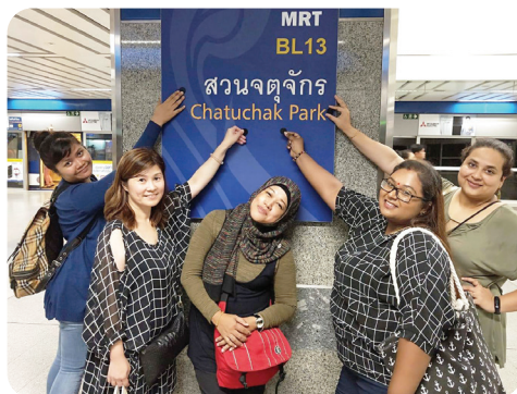
Principals' Annual Retreat