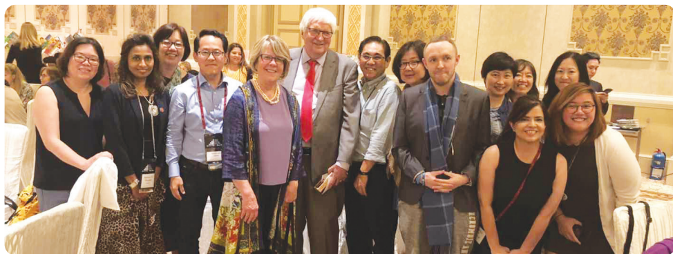
Overseas study trips – in Picture: World Forum in Macau