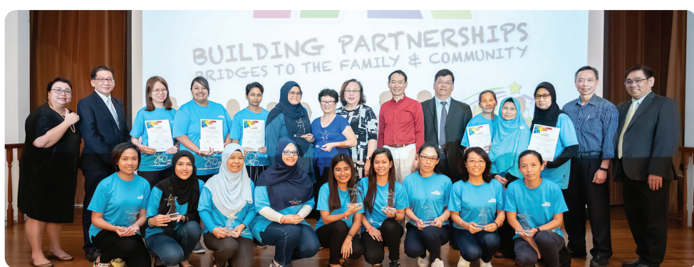
Staff Recognition at Annual Skool4Kidz Day