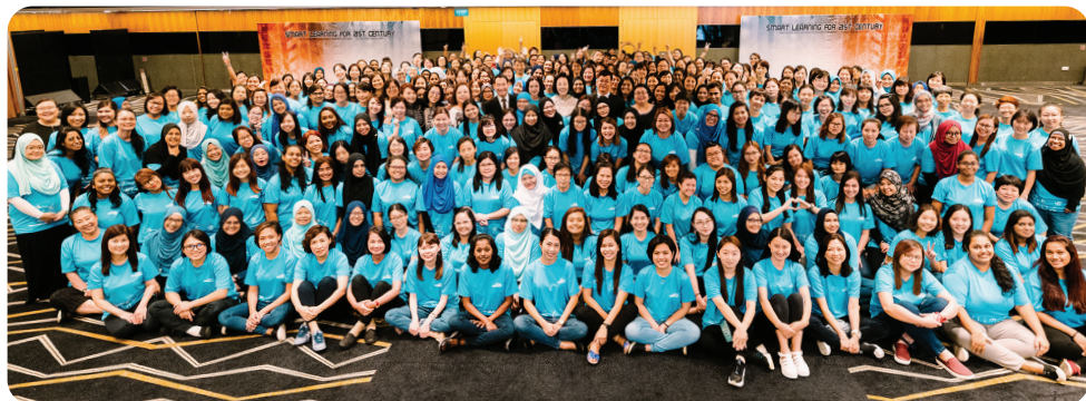
Annual Teachers' Training 员工常年培训活动