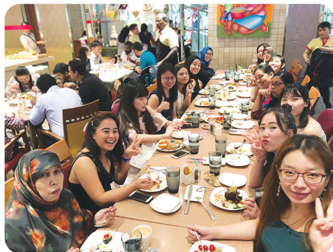
Staff Bonding Events