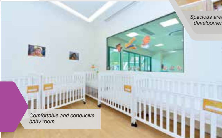
Comfortable and conducive baby room