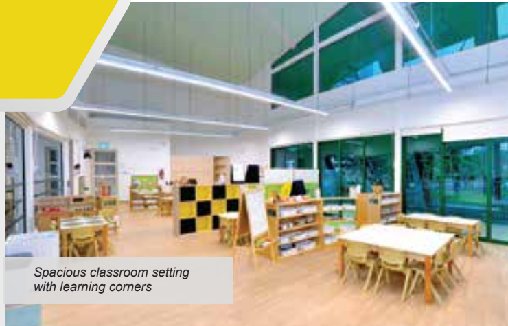
Spacious classroom setting with learning corners