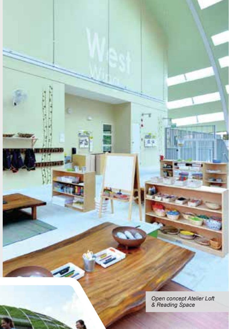
Open concept Atelier Loft & Reading Space

With such enriching facilities, every parent can anticipate a happy and memorable learning experience that will help their child look forward to a fruitful life-long learning journey.