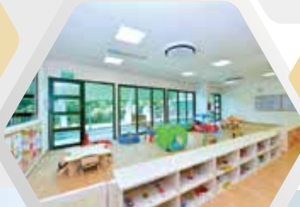
Spacious area for gross-motor development and play time