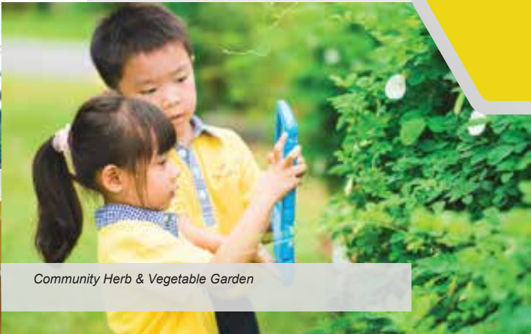
Community Herb & Vegetable Garden