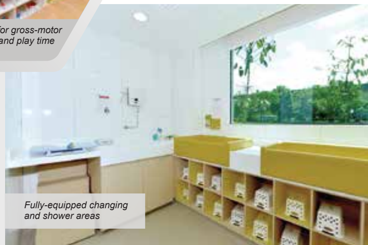
Fully-equipped changing and shower areas