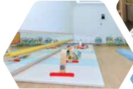
Well-padded play area to encourage crawling and first-steps

We have designed an age and needs-appropriate curriculum that promotes love, respect and understanding. Our qualified educators will also provide your infant with the most devoted care, in an environment that is healthy and safe, yet stimulating, to allow them to explore and grow.