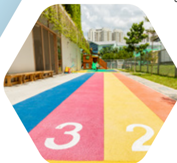
Physical play area, SPORTS.