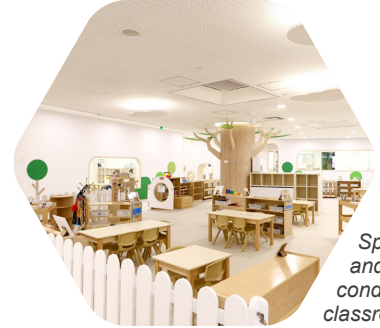
Spacious and conducive classrooms

Our preschoolers are nurtured to be winners at their own pace, including in award-winning global arena.